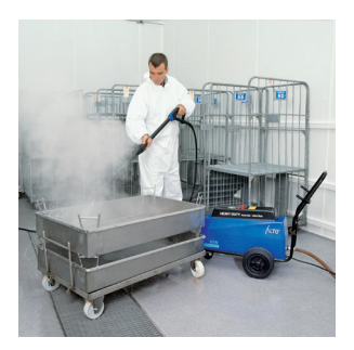
Selected references Kraft, Nestlé, Danish Crown, Daloon, Tulip, Knorr, Singapore Airport Catering, Ahlgreens, Estrella, Kelloggs, McDonalds, Ferrero, Delmonte Foods. Complete reference list available on request.