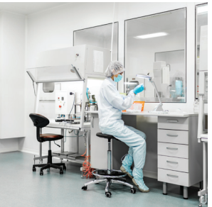
Selected references Pfizer, GSK, Astra Zeneca, Johnson & Johnson, Aventis, Sandoz, Smith Kline. Complete reference list available on request.